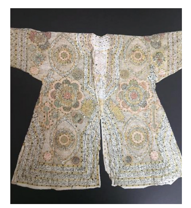
Figure 8 Shirt with floral pattern and prayer (detail TSM 13/1402)