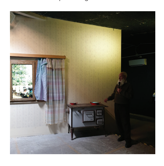
Photo 1 The artist explaining the House Turned Inside Out on the guided tour, 16 April 2023

Both exhibitions' iconic piece was the house as a space of clashing values, habits, and generations. While in 2012 The House was a monumental art installation presenting the space of rural dwelling from the outside, in 2022 the House Turned Inside Out gives us a different perspective: not as a clash, but rather as a contemplative endeavour (Radnóti, 2023). While in 2012 the house had four very different sides in terms of social standing and values, in 2022 there is an archetypical space imagined around the stove, pots, and tomato soup.